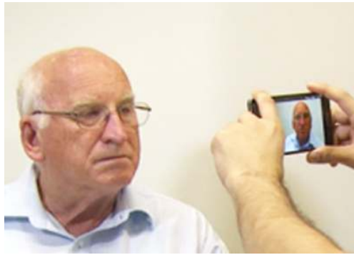
ePAT App in practice - assessing pain severity

The ePAT App is being developed and will be rolled out globally in two phases: first, the ePAT App for Dementia for persons who have lost the ability to communicate with their carers, and the second, the ePAT App for Children who have not yet learnt to speak.